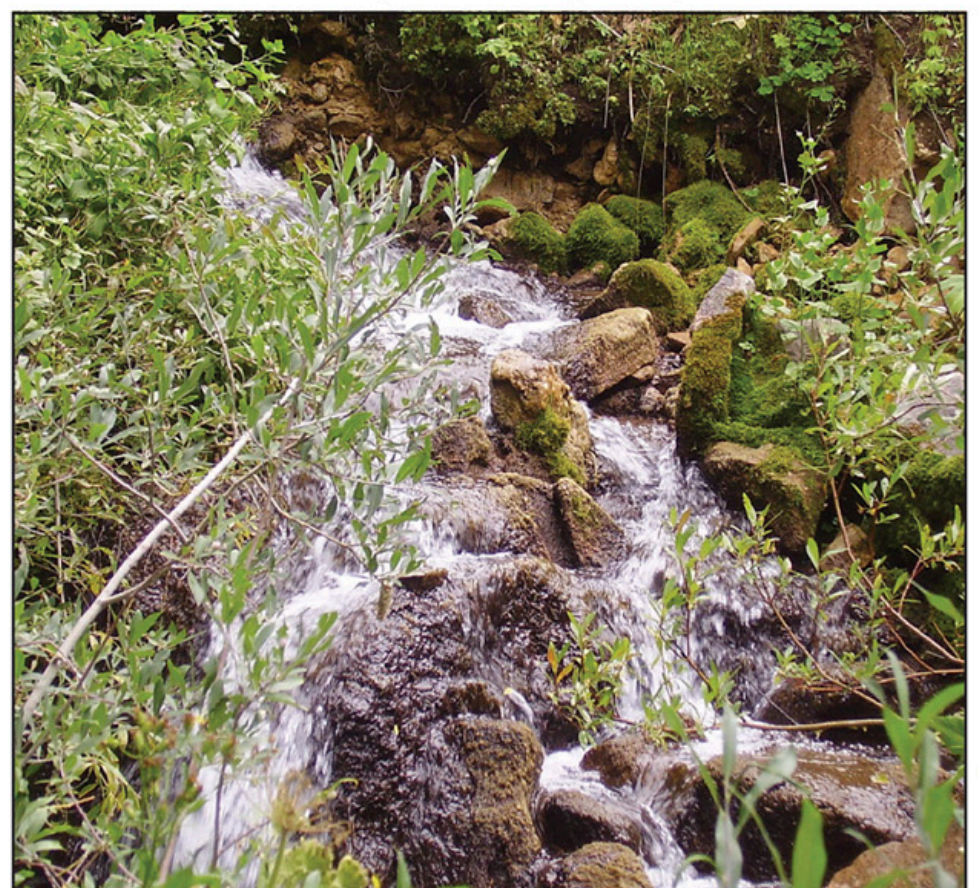
Also an amateur photographer, Theresa captures beauty wherever she can find it.